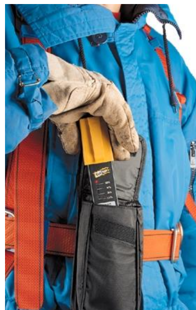
RadMan XT used as a personal monitor for radio frequency fields

As a locating unit all RadMan versions can be used to locate leaks on waveguides and coaxial screw connectors (picture on the right). A non-conductive extension with handle is available as an optional accessory.