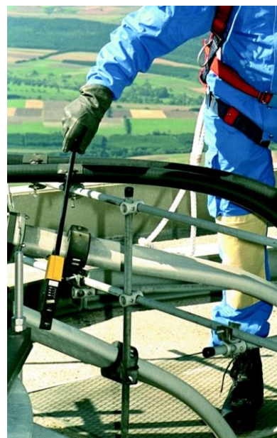
RadMan XT used as an instrument for leak detection