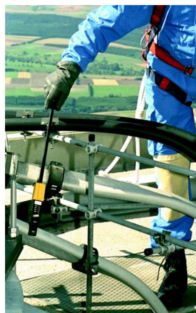
RadMan XT used as an instrument for leak detection