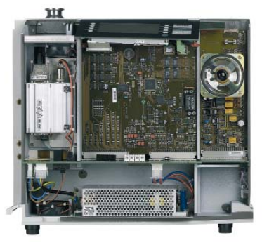
Internal design clear and maintenance-friendly

Customised PHOENIXL 340 for parts testing in series production