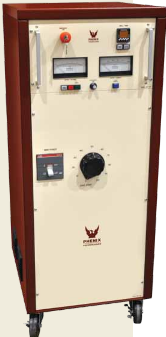
Model 615-7.5P (with dwell timer option)