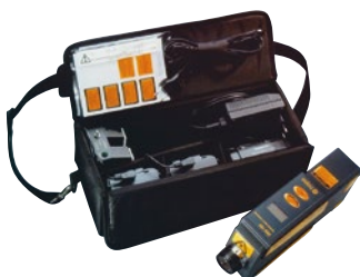
PDV-100 Transportation bag