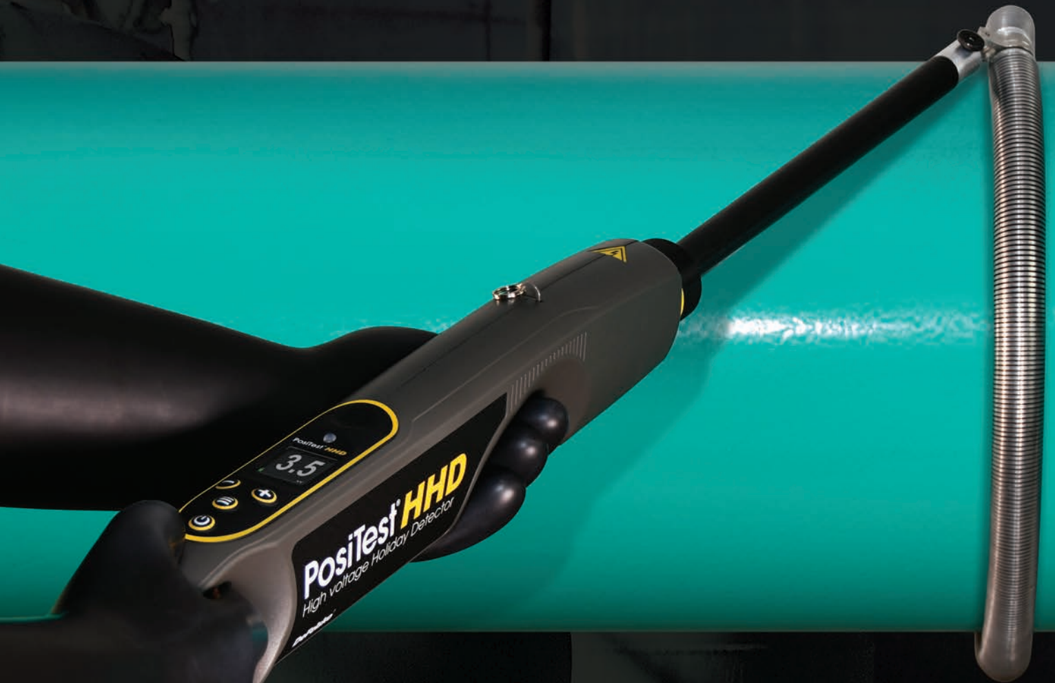
Optional handheld wand with insulated cable

Detects holidays, pinholes and other discontinuities using pulse DC