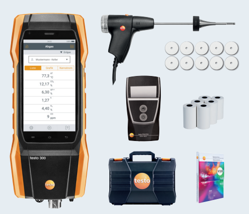
Illustration differs depending on kit type