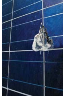
The solar module soiled by bird droppings

After cleaning the concerned modules the system runs perfectly again.