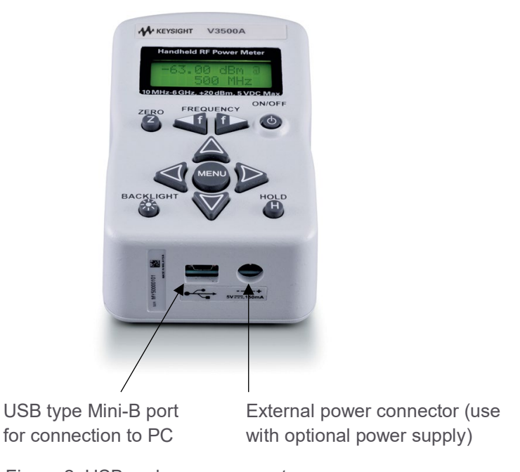
Figure 2. USB and power connector