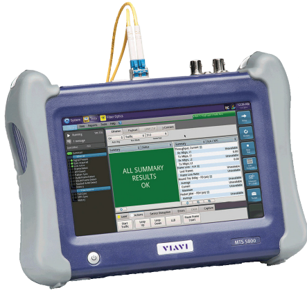
TB5800-CPRI SERIES Tester unit only shown. Kits include additional features.