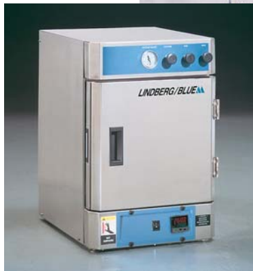
Model VO914A (above) with painted exterior. VO Series vacuum ovens include digital controls, front-mounted controls for vacuum, gas and vent functions, and shelves (see chart).