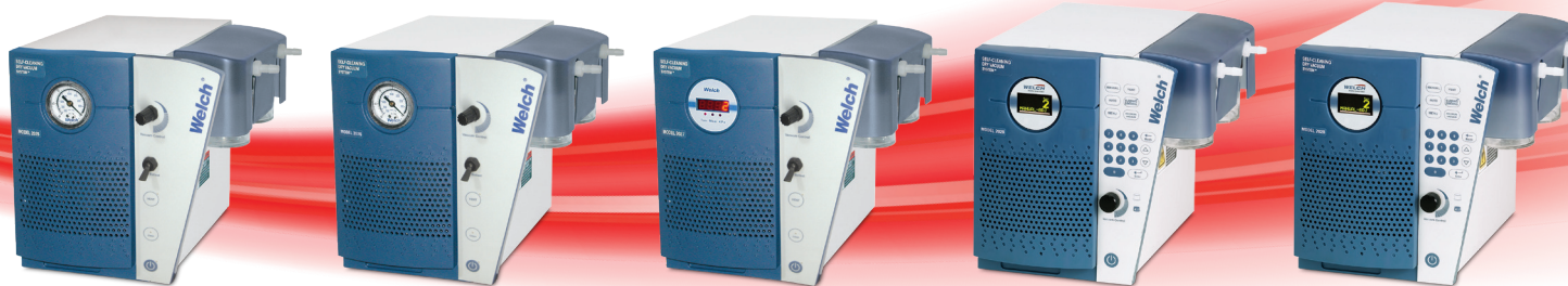
202501 (35 l/min; 9 Torr) Analog gauge

Complete oil free, chemical duty vacuum systems down to 2.0 Torr with vacuum pressure control, inlet and outlet traps, gauges and self-cleaning purge