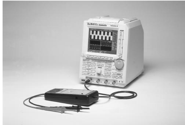
Example of probe connection with DL1540CL digital oscilloscope Two or more differential probes can be connected to measure signals with different ground levels on each channel.