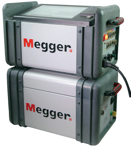
DELTA4310A test set shown above with onboard computer