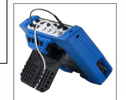
Easel and Wire Management

7" color, wide screen touch display. 40% larger than before - the largest in the industry!