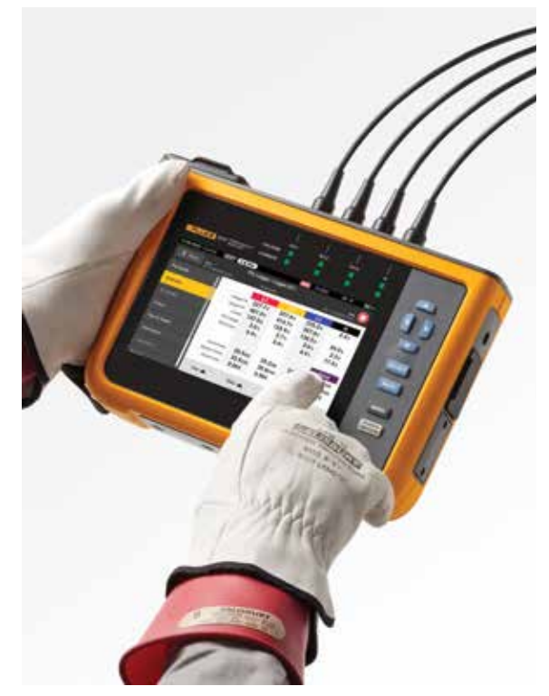
Easily navigate using the large color touchscreen

When downloading data from the Fluke 1770 Series Power Quality Analyzers the included Energy Analyze Plus software package can compare measured voltage and current harmonic statistical data to different standards, like EN 50160 or IEEE 519, to determine if they exceed compliance limits. This powerful predictive maintenance feature enables current harmonics to be observed before distortion appears in the voltage allowing you to prevent unexpected failures or non-compliance situations and increase system uptime. With the proliferation of inverter-based loads and power generation, keeping current harmonics in check is becoming increasingly critical to ensure reliable power quality and avoid system downtime.