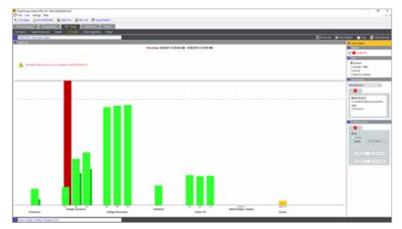
Fluke Energy Analyze Plus: Power quality health summary