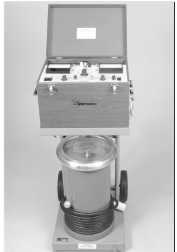
Model 100 HVT AC Hipot Tester

A triple range current meter enables low current readings of 0 to 1/10/100 mA on the 100 HVT. A triple range voltmeter is connected directly across the output for maximum accuracy. The 100 HVT has a 50 kV tap that is used for bucket liner testing and other low voltage, high current test requirements.