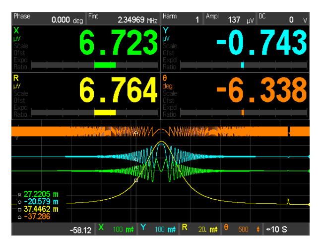
Large numeric readout with strip chart recording

The SR860's effective dynamic reserve is simply the ratio of these two settings. For instance with a 10 nV sensitivity setting and a 300 mV input range the effective dynamic reserve of the SR860 is 3 \times 10^7 , or nearly 150 dB.