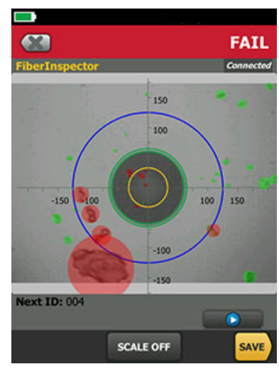
Defects that fail the standard's requirements are colored Red

Certify your fiber end-faces to industry standards – IEC 61300-3-35. Or if you prefer, you can manually grade your end-faces.