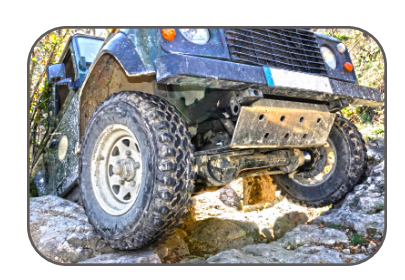
Off Road Measurements