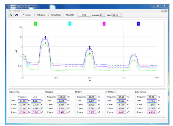
Figure 7: FFT analysis with display of amplitude spectrum