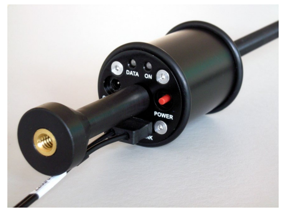
Figure 3: Connector side of HP-01 with tripod adapter attached

The HP-01 is operated using the HP01-TS software supplied, which is compatible with all Microsoft Windows ® based PCs running Windows 7 or above. An optical cable with USB adapter links the measuring device to the PC. The measurement can therefore be controlled from a safe distance of up to 10 m. This can be extended to 50 m with cables, available as options. Alternatively, the operation can also be carried out via the NBM-550 measuring device (Figure 4).