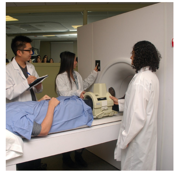
Figure 1: Particularly high static magnetic fields are generated by magnetic resonance tomography (MRT)