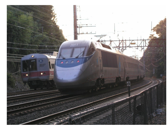
Figure 2: Static magnetic fields are also present in DC powered railroads