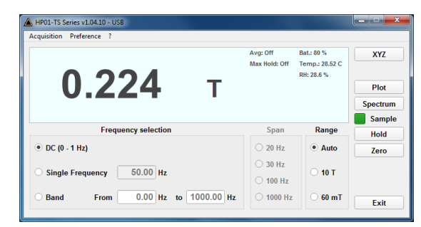
Figure 5: Main window with display of measurement parameters and numerical result