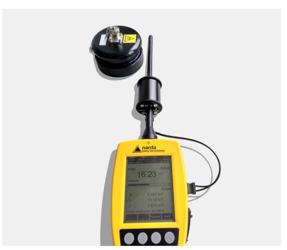
Figure 4: Measurement on a permanent magnet with operation via the NBM-550 measuring device