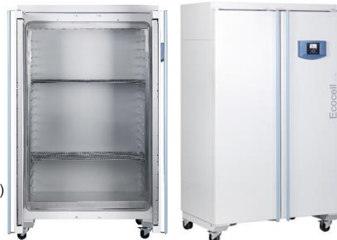
Model 707 (25 ft3)

BMT USA 14532 169 th Dr. SE, Suite 142 Monroe, WA 98272 USA