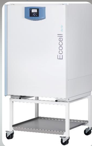
Ecocell ECO 222 (8 ft3) with optional Rolling Cart Caster Options ...