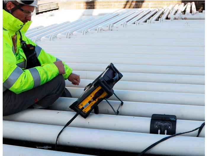
Figure 4: Sonyks instrument with the Magneto collar on site.

Sonyks is an incredibly versatile system that allows operators to address more applications thanks to short-range and medium-range capabilities in addition to long-range ultrasonic testing. For example, use the new 128 kHz magnetostrictive collar to inspect flanged pipes efficiently.