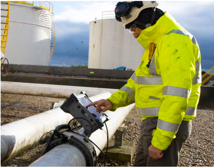
Figure 3: Sonyks instrument with the Piezo tool on site.

Sonyks is the first instrument with an onboard screen for GWT interpretation. It uses a combination of broadband and Full Matrix Capture (FMC) data collection, meaning that all data ever needed is collected once to make analysis possible anywhere. Move on to the next location knowing you have all the necessary data with increased speed and peace of mind.