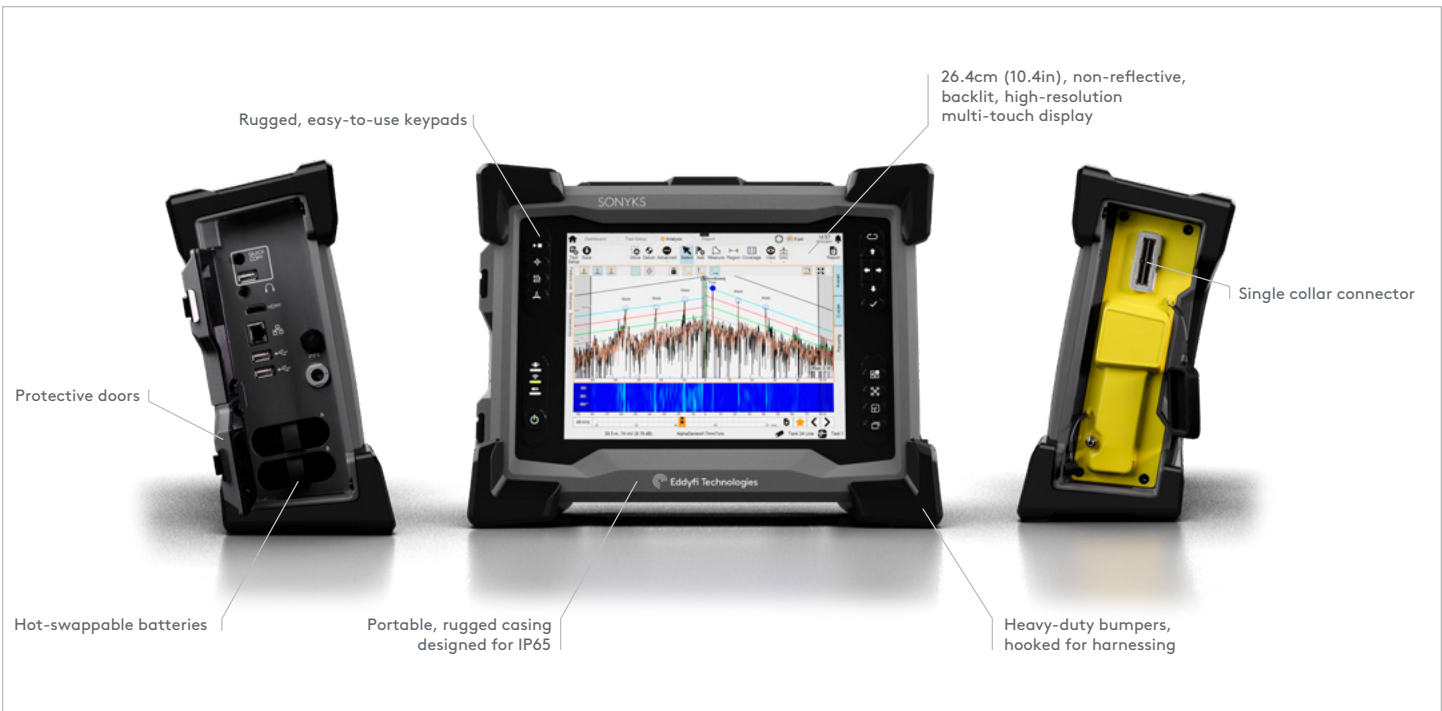
Figure 1: Annotated breakdown of Sonyks instrument.