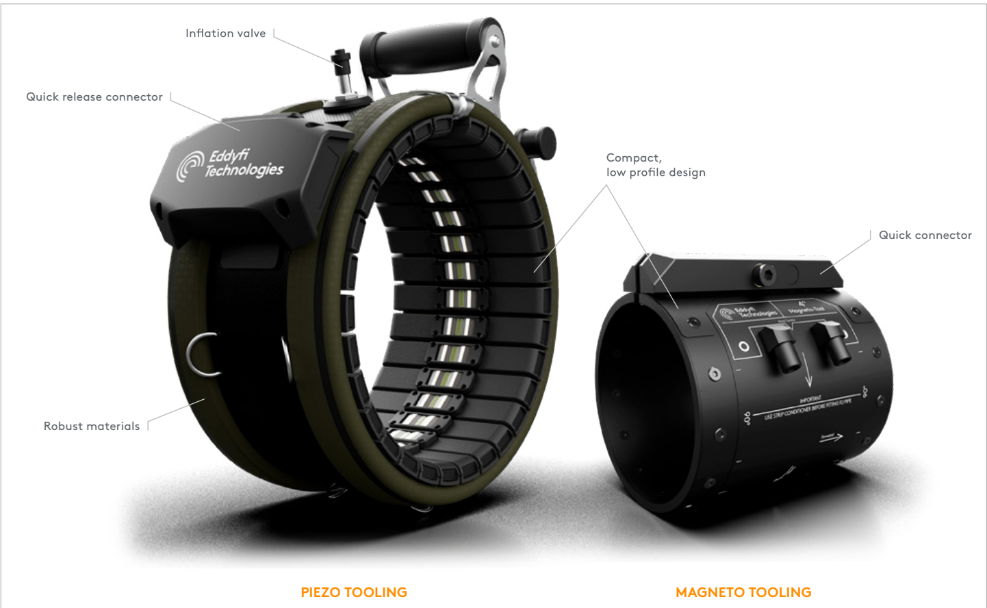
Figure 2: Annotated breakdown of Sonyks Piezo and Mageto tool.