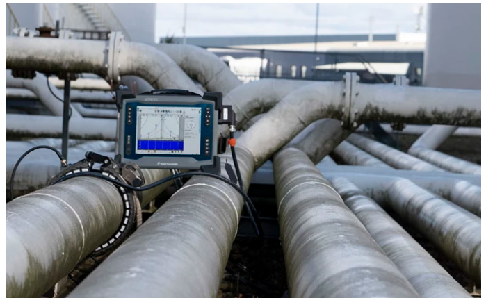
Figure 5: Guided wave 20cm (8in) pipe inspection with Sonyks Piezo tool.