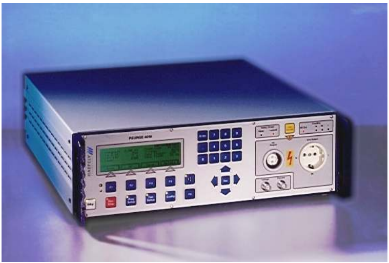
PSURGE 4010 - the compact IEC combination wave generator