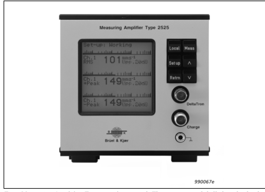
Fig.\,1 Measuring Amplifier Type 2525 front panel. The axes are not labelled as the display is intended as a visual monitor only

In addition to the measurement and display set-up features, a number of general options can be selected: