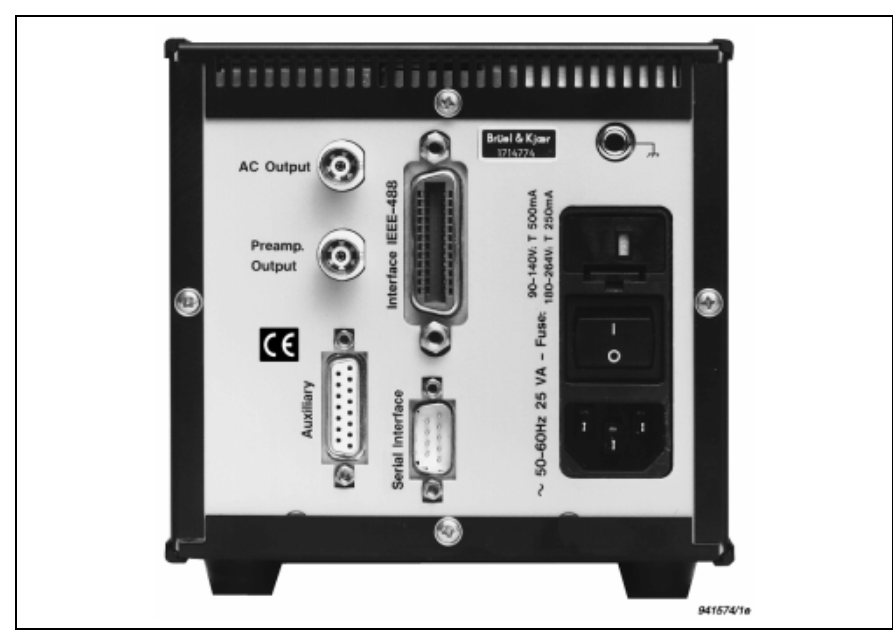
Fig. 2 Measuring Amplifier Type 2525 rear panel