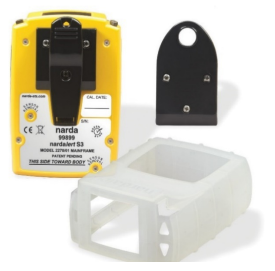
Fig. 3. Silicon rubber skin and interchangeable clips

We packaged everything in a rugged plastic housing that allows you to use it mounted in a common shirt pocket or secure it with the supplied lanyard or belt-clip mounts. We supply a strong silicon rubber skin that provides additional shock protection as a standard accessory.