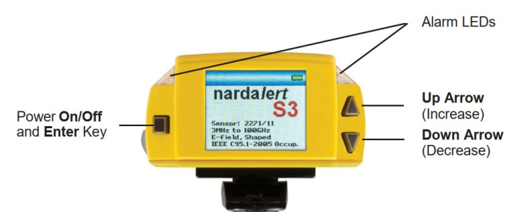
Fig. 1. Top view with display and controls

Alarm events are always evident with visual LEDs combined with vibration and audible notifications. However, to provide the user more accurate information than just simple alarms, we have incorporated a top mounted LCD. The LCD simplifies operation, showing key data at start-up such as battery state and sensor information that the operator needs. With RF/ microwave sensors attached, the display indicates to the user the bands (<> 1 GHz) that are being detected. Optioned units use the display to provide even more information such as exposure history, logged data, alarm indications and more.