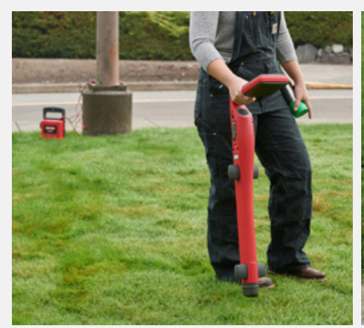
Trace an individual utility by connecting the transmitter directly with the test leads