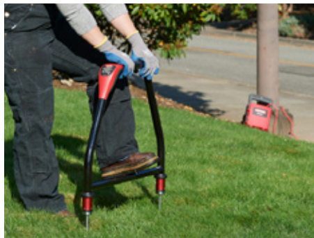
Pinpoint fault location by using the AF-600 with the UAT-600 Transmitter