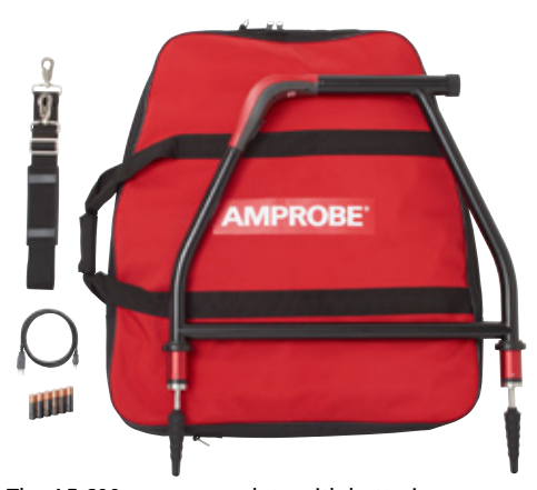
The AF-600 comes complete with batteries and a carrying case