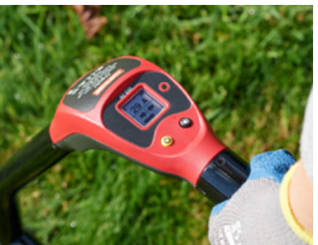
Clearly view the LCD display in bright sunlight