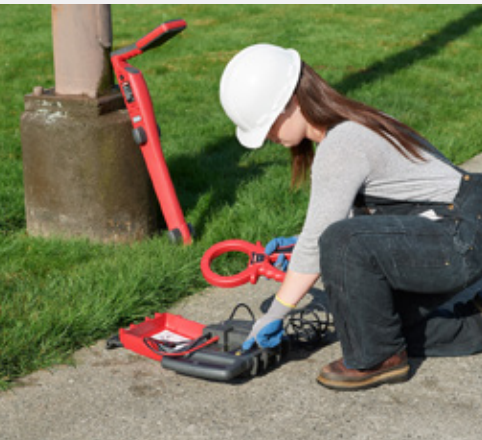
The Transmitter will automatically change modes based on which accessory is plugged in