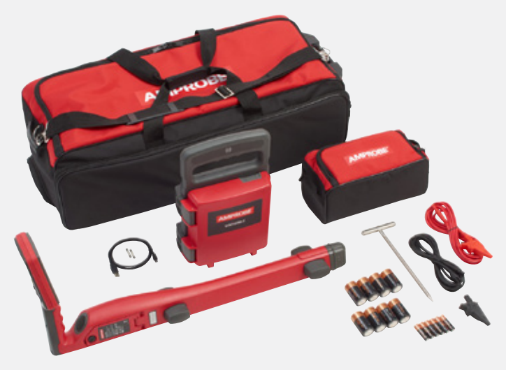
UAT-610 Underground Utilities Locator Kit