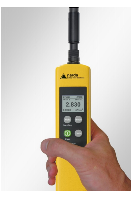
Small, lightweight and rugged design – ideal for use in rough environments

Suitable measuring probes for electric and magnetic field strengths are available for the frequency range from 100 kHz up to 90 GHz. So-called shaped probes which have frequency responses that weight the results according to specific human safety standards are available in addition to flat probes with flat frequency responses. All probes are calibrated independently from the measuring instrument. They include a non-volatile memory containing the probe parameters and calibration data, so they can be used with any instrument in the NBM-500 family.