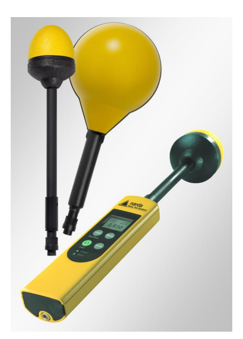
Changing the probe is quick and easy, with no need to reconfigure the device