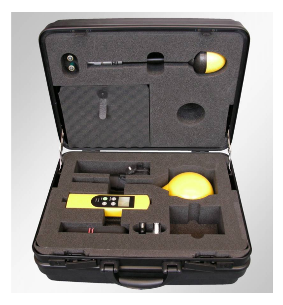
A rugged transport case is included. This provides ideal protection for the instrument, together with up to two probes and all accessories.