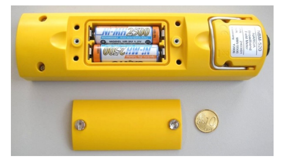
The battery compartment is opened easily using a coin. Two replaceable NiMH rechargeable batteries (AA size) are used to power the device.