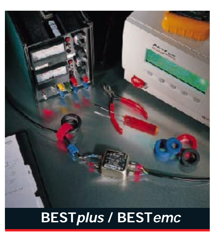
conducted immunity test system

BURST SCHAFFNER Your number one name for EMC