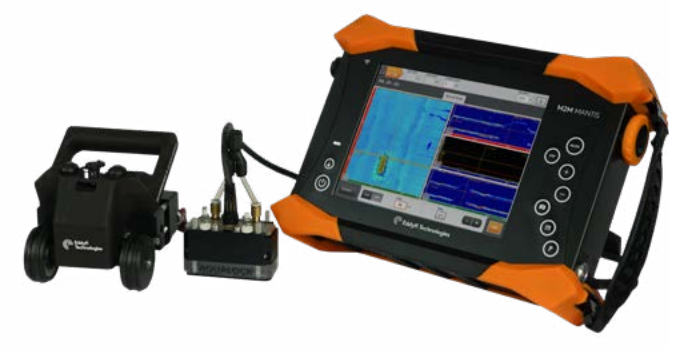
Play/Pause/Increment buttons to use with Eddyfi scanners