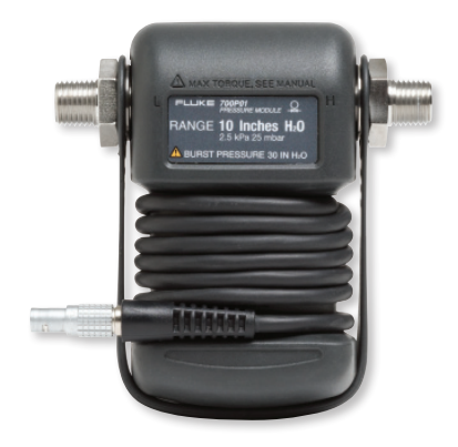
The 7250LP is specifically designed to calibrate low pressure gauges, transducers and portable calibrators such as the Fluke 700 series, as well as Magnahelics and virtually any low pressure sensor, gauge or test equipment.

Computer interface: The 7250LP is provided with both an RS-232 and IEEE-488 interface, and syntax for all Series 7250s follows SCPI protocol for easy programming. COMPASS for Pressure, an off-the-shelf software package, is available. As a standard feature, software written for Ruska's previous generation Series 7215, 7010 and 6000 instruments is fully supported by the 7250LP. The 7250LP can be set to 510 emulation mode to use software originally written for the GE Druck DPI 510. Firmware updates can be performed over the RS-232 interface. A MET/CAL® software driver is available. In addition, a LabVIEW driver is available as a free download.