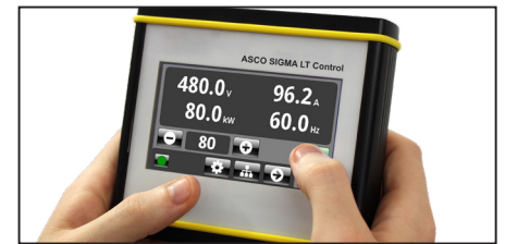
Optional SIGMA LT Hand-Held Terminal.

SIGMA software can be updated free of charge through the Avtron website at the following link .