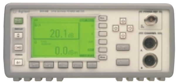
E4419B dual-channel power meter