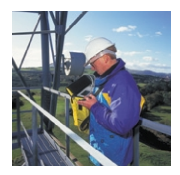
The battery option and operating case bring Agilent's power accuracy and ease-of-use to field applications.