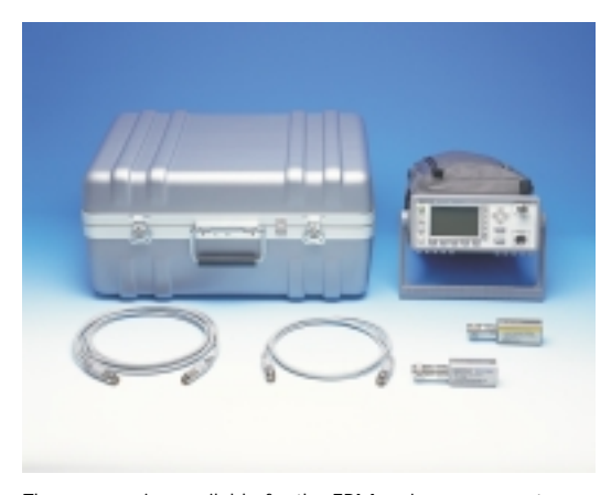
The accessories available for the EPM series power meters are ideal for installation and maintenance situations.

The optional rechargeable battery (option 001), which provides up to 5.5 hours of continuous operation, means you can use the EPM series power meters in a mains-free environment. The battery charges in less than three hours, during which time the meter can be used, and the charge level indicators keep you informed of the battery status at all times. The soft carry / operating case (34141A) makes it easy to use the EPM series power meter in installation and maintenance environments. Front and rear-panel bumpers protect the power meter from everyday knocks. A bail handle makes it easy to carry. The EPM series power meters are lightweight—weighing approximately 4kg (9 lb).