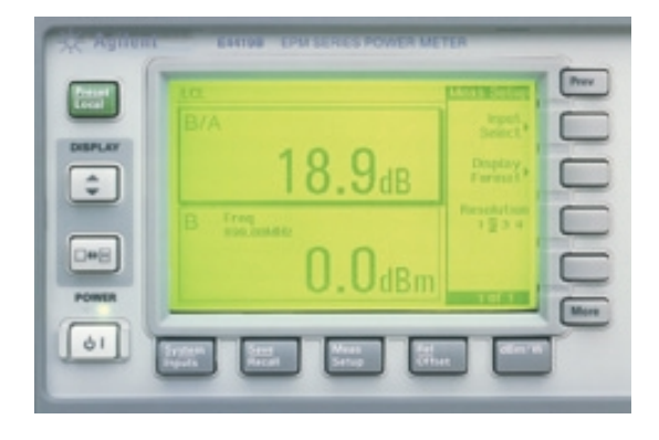
With the E4419B, ratio and difference measurements can be made. Here the upper half of the display shows the gain of a GSM amplifier while the lower half of the display shows the B Channel absolute power measurement in dBm.