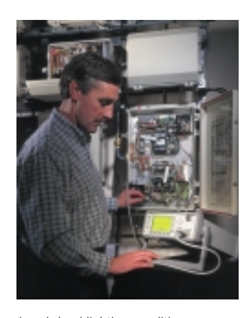
In subdued lighting conditions, you can easily read the high resolution display.