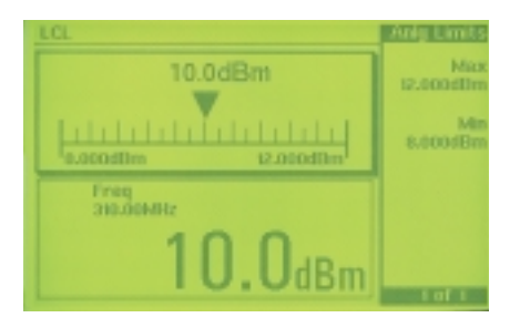
In this setup, the top half of the split display shows the analog peaking meter while the bottom display shows the same measurement with a larger character size.