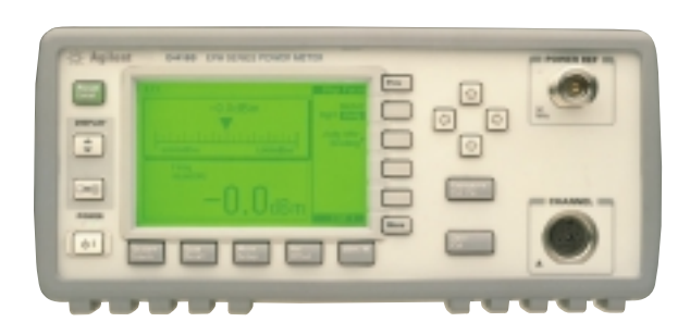
E4418B single-channel power meter