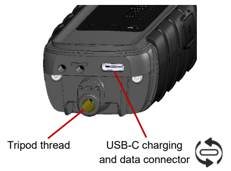
Fig. 2. View with cover open

The newly developed sensor test provides additional assurance. The correct function of each sensor is checked every time the RadMan 2 is switched on. The device does not need to be checked anymore with a test generator before starting work.