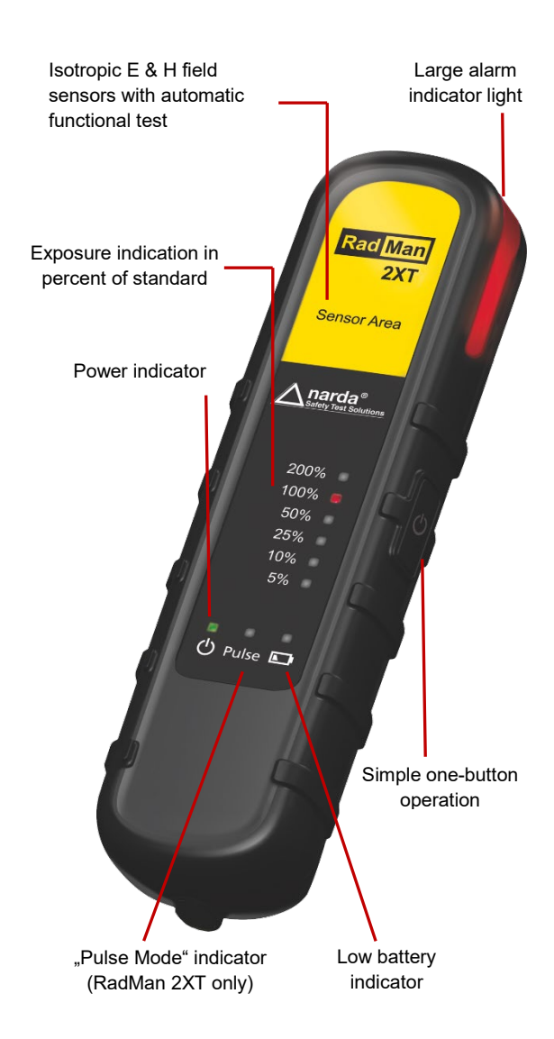
Fig. 1. Front view with controls and indicators

The actual field exposure level is indicated in six steps from 5% to 200% by LEDs. The percentages refer to the proportion of the power density limit value specified in a safety standard. If the field exposure level exceeds 50% of the limit value, the device vibrates and emits a loud alarm tone. There is also a bright light in the top part of the RadMan 2 that can be easily seen from various angles. The light flashes red in time with the alarm signal. A second, more persistent alarm sounds when the 100% threshold is exceeded, warning the user to leave the danger area. Device versions with alarm thresholds that can be set using PC software are also available.