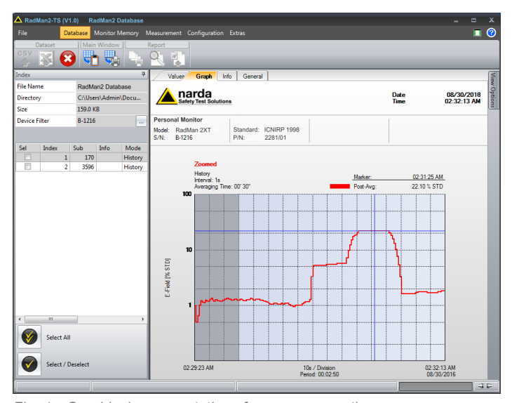
Fig. 4. Graphical representation of exposure over time

The additional RF Detection Mode with its tone search function enables precise localization of leaks in waveguides and coaxial screw connectors. As the pitch of the tone changes when the field source is approached, this feature can also be used to quickly and simply check that an antenna has been switched off.