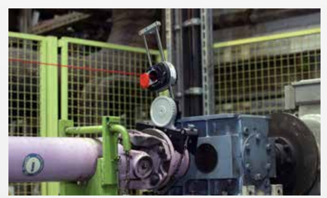
Rotating arm bracket for restricted rotation areas.