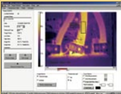
Capture clear thermal images and easily analyze the radiometric (temperature) data for all 19,200 pixels.

Analyze individual images, easily identify hot (or cold) spots and select areas for min., max. and avg. temperature values.