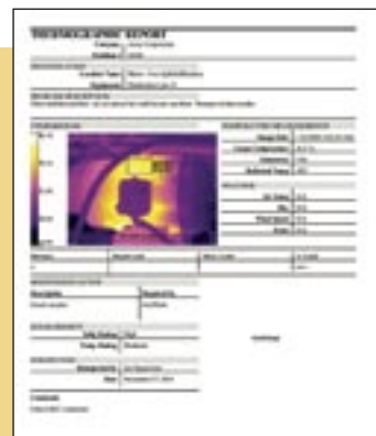
Quickly and easily create professional reports using InsideIR software.