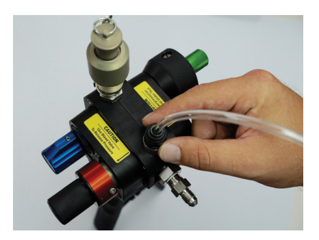
Fig. 5-2 Attaching the cleaning tube to the reservoir inlet