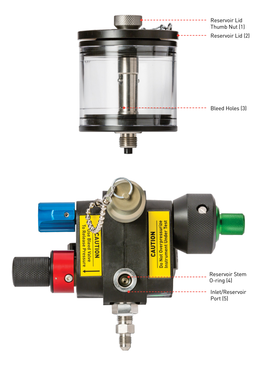
Fig. 3-2 Detail of Hydraulic Reservoir components