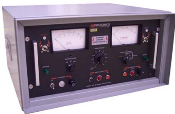
HD100 Series AC/DC Hipot Tester

The AC/DC output configuration eliminates the need for purchasing separate AC and DC hipots. Output connected voltmeter ensures accurate voltage measurements regardless of output loading. They are capable of testing to most industry specifications such as UL, CSA, VDE, IEC, and MIL for dielectric withstand testing.