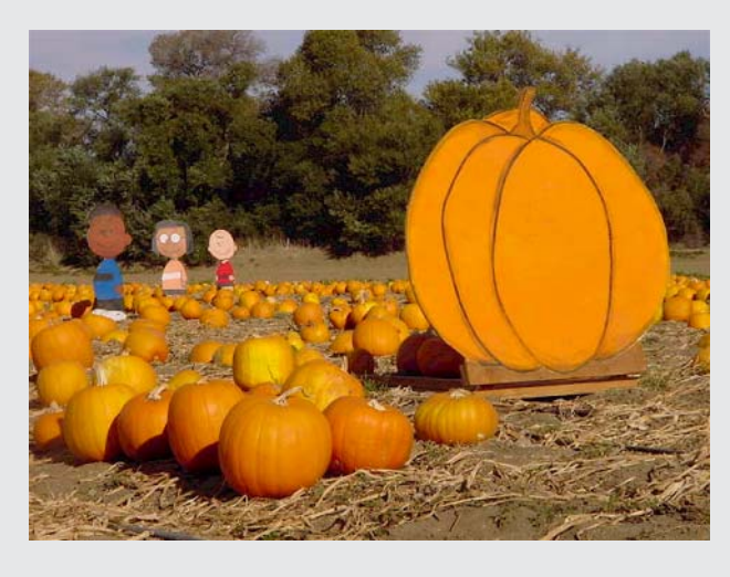
near Salinas CA...