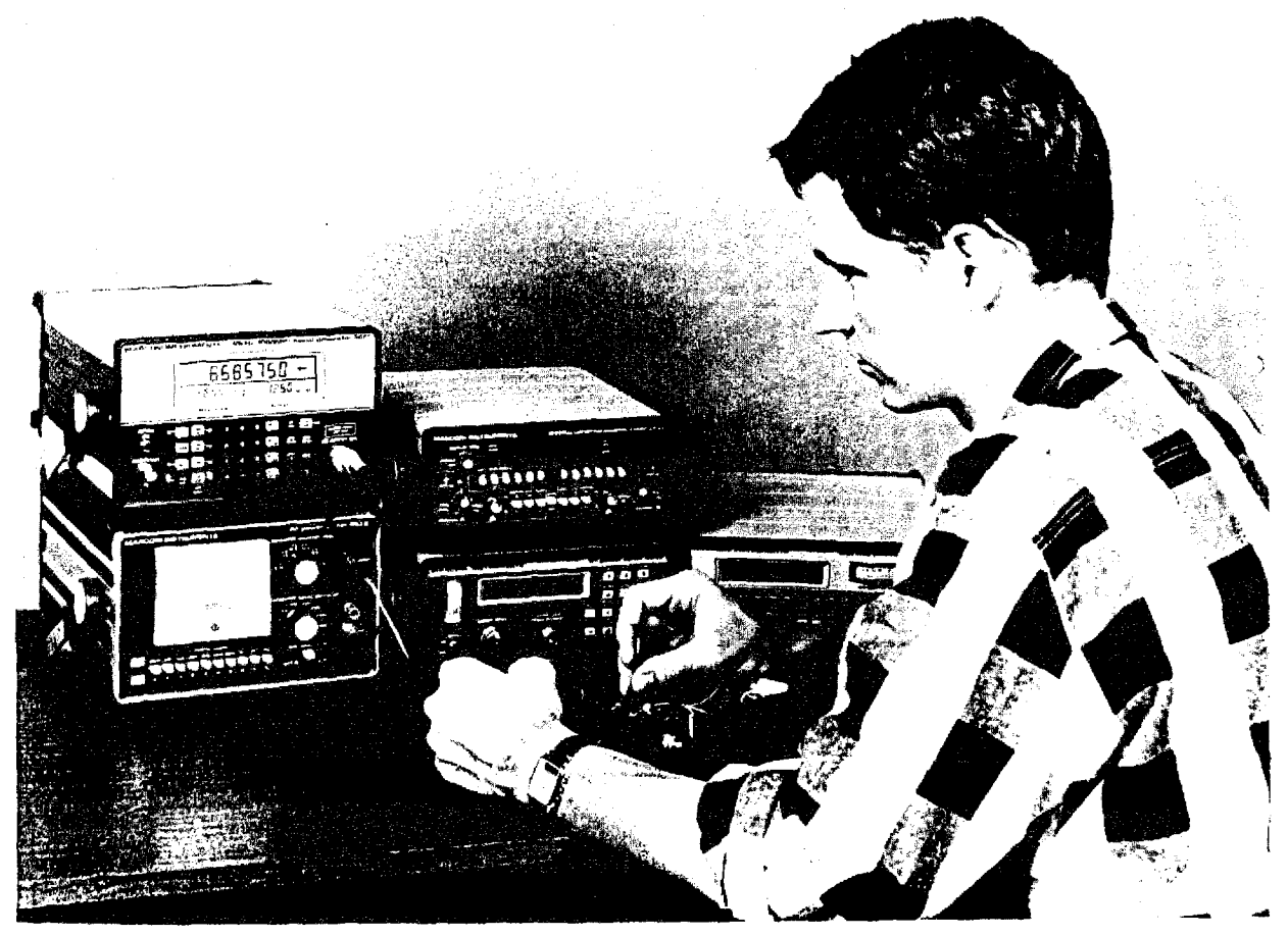
AMIFM Signal Generators 2022A and 2022C are ideal for a variety of applications in receiver testing.