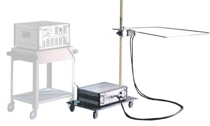
MAG 100 current transformer, 1mx1m antenna mounted on support stand (right) shown with the power source (left)

Power Frequency Magnetic Field Test Equipment