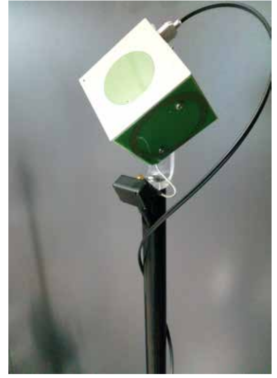
The electromagnetic field analyzer

The power supply is provided by a Ni-Mh battery, installed internally to the cubic housing.