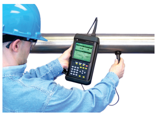
Optional pipe wall thickness gauge

Pipe wall thickness is a critical parameter used by the TransPort PT878GC flowmeter for clamp-on flow measurements. The thickness-gauge option allows accurate wall thickness measurement from outside the pipe.