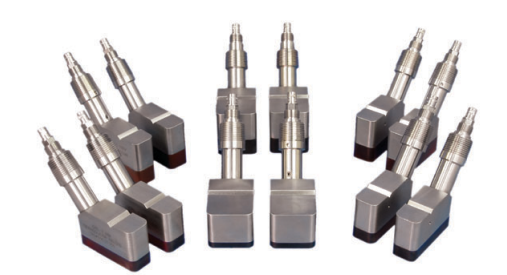
GE's technologically advanced clamp-on gas ultrasonic transducers

The new line of clamp-on gas transducers produces signals that are five to ten times more powerful than those of traditional ultrasonic transducers. The new transducers produce clean, coded signals with very minimal background noise. The result is that the TransPort PT878GC flowmeter system performs well even with low-density gas applications.