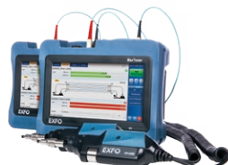
Fiber certifier OLTs MaxTester 940