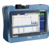
OTDR MaxTester 700B Series