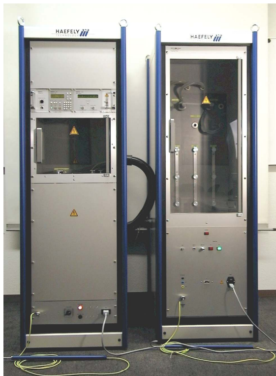
PSURGE 30.2 generator rack (left) with FPSURGE 3010 coupling network (right)

The integration in the WinPATS control and reporting software package enhances an efficient set-up and operation of this test system. Most importantly, the test load can be transferred to a computer freeing valuable resources. An integrated test cabinet provides optimal and safe connections for component testing.