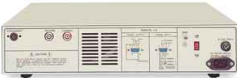
HYAMP® II includes rear panel high current and return connections and remote control connections to make it easier to build into a rack mount system.