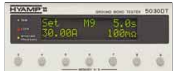
High resolution LCD clearly indicates setup parameters and test results.