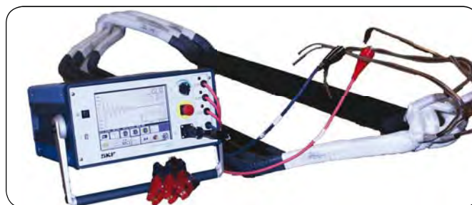
Testing a coil utilizing the Baker DX.

The Baker DX unit is among the first on the market to have specific coil testing software. The Baker DX unit can be placed into an impulse mode for quick application of voltage to the coils. The software can store and display up to 200 waveforms on the screen for quick analysis of coil condition. Utilize SKF's Error Area Ratio (EAR) method to calculate the differences between the coils for quick, accurate analysis of the data. The EAR calculation greatly reduces operator error and automatically indicates a defective coil when the result is out of the programmed tolerance level. Report and analyze your data easily with bar charts to help locate and report faulty coils, and for an at-a-glance summary of all coils tested.