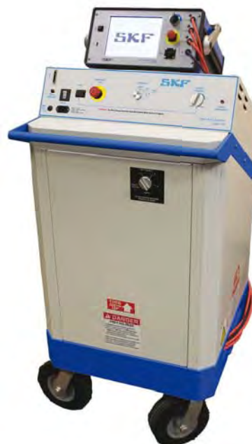
Baker DX with the SKF Static Motor Analyzer Baker 30.