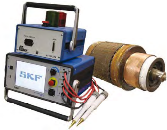
Baker DX with the AT101 ZTX.

The Baker DX can store up to 200 results per folder for quick, easy analysis and reporting. The data is also stored in a chart for accurate and easy armature analysis. All interpoles and field coils can be easily analyzed and stored in the Baker DX's multi-result file management system.