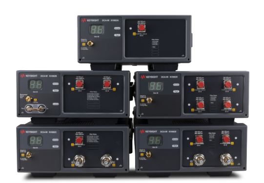
Optical + Electrical DCA-M