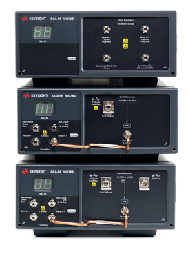
Optical + Electrical and Electrical Clock Recovery

The N1000A user interface and operating system is identical to the FlexDCA interface of the DCA-M modules (over a simple USB 2.0 or 3.0 connection) and N1010A FlexDCA on a PC.