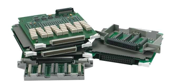
3499A/B/C Switch Modules

cables can be ordered in addition to the modules. The ability to order the terminals separately enables the user to purchase dedicated terminals for different applications so the terminal will not need to be re-wired if the same test system is used for different applications. Other modules such as the 4447xx, or Optics, Microwave, and RF modules include the terminals (i.e. SMA, BNC...) for application specific connections. See the 3499A/B/C data sheet for specific module wiring connection details at www.agilent.com/find/3499.