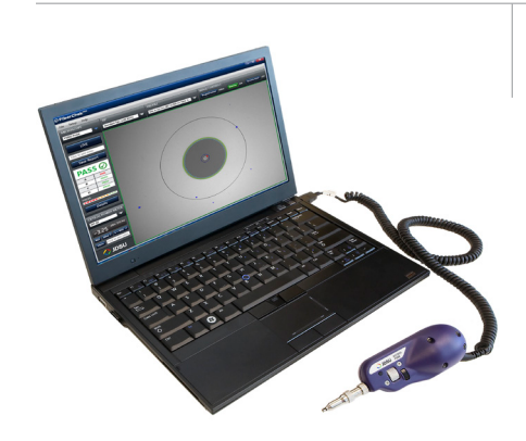
Laptop not included.

Automated Fiber Inspection and Analysis Software & Probe